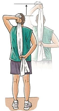
TOWEL RESISTANCE EXERCISE

2. TRICEPS TOWEL STRETCH: Stand with one arm over your head holding the end of a towel. Put your other arm behind your back and grab the towel. Stretch your top arm behind your head by pulling the towel down toward the floor with hand of your bottom arm. Keep the elbow of your top arm as close to your ear as possible. Hold for 15 to 20 seconds. Repeat 3 to 6 times.