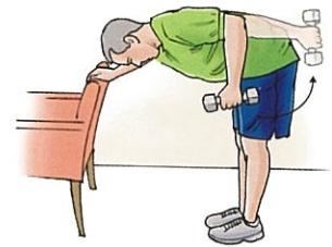
TRICEPS KICK BACK

6. TRICEPS KICK BACK: Lean forward with the hand of one arm resting on a table or chair for support. Hold a weight in the hand of your other arm. Keep the elbow of that arm against your side. Your arm should be bent at a 90-degree angle with your upper arm parallel to the floor. Move the forearm of your arm backward until it is straight. Repeat 10 to 20 times.