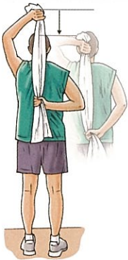
TRICEPS TOWEL STRETCH

2. TRICEPS TOWEL STRETCH: Stand with one arm over your head holding the end of a towel. Put your other arm behind your back and grab the towel. Stretch your top arm behind your head by pulling the towel down toward the floor with hand of your bottom arm. Keep the elbow of your top arm as close to your ear as possible. Hold for 15 to 20 seconds. Repeat 3 to 6 times.