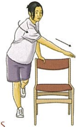
BALANCE AND REACH EXERCISES

B. Stand in the same position as above. While maintaining your arch height, reach the hand farthest away from the chair across your body toward the chair. The farther you reach, the more challenging the exercise. Do 2 sets of 10.