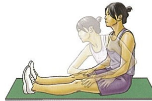
THORACIC SIDE STRETCH

7. THORACIC SIDE STRETCH: To stretch your right upper back, point your right elbow and shoulders forward while twisting your trunk to the left. Hold for a count of 15. Repeat 3 times. To stretch your left upper back, point your left elbow and shoulder forward while twisting your trunk to the right. Hold for a count of 10. Repeat 3 times.