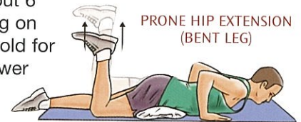
PRONE HIP EXTENSION (BENT LEG)

5. PRONE HIP EXTENSION (BENT LEG): Lie on your stomach with a pillow underneath your hips. Bend one knee, tighten up your buttocks muscles, and lift your leg off the floor about 6 inches. Keep the leg on the floor straight. Hold for 5 seconds. Then lower your leg and relax. Do 3 sets of 10.