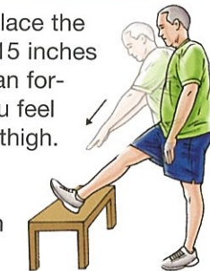
STANDING HAMSTRING STRETCH

2. STANDING HAMSTRING STRETCH: Place the heel of your leg on a stool about 15 inches high. Keep your knee straight. Lean forward, bending at the hips until you feel a mild stretch in the back of your thigh. Make sure you do not roll your shoulders and bend at the waist when doing this or you will stretch your lower back instead. Hold the stretch for 15 to 30 seconds. Repeat 3 times for each leg.