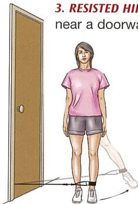
RESISTED HIP ABDUCTION

3. RESISTED HIP ABDUCTION: Stand sideways near a doorway. Tie elastic tubing around the ankle on your leg which is away from the door. Knot the other end of the tubing and close the knot in the door. Extend your leg out to the side, keeping your knee straight. Return to the starting position. Do 3 sets of 10.