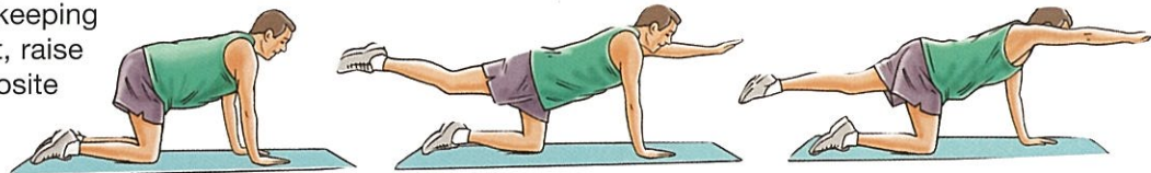
QUADRUPED ARM/LEG RAISE

Lower your arm and leg slowly and alternate sides. Do this 10 times on each side.