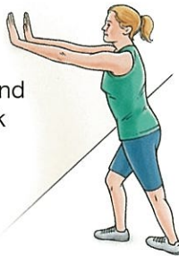
STANDING CALF STRETCH

2. STANDING CALF STRETCH: Facing a wall, put your hands against the wall at about eye level. Keep one leg back with the heel on the floor, and the other leg forward. Turn your back foot slightly inward (as if you were pigeon-toed) as you slowly lean into the wall until you feel a stretch in the back of your calf. Hold for 15 to 30 seconds. Repeat 3 times. Do this exercise several times each day.