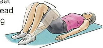
HIP ADDUCTOR STRETCH

4. HIP ADDUCTOR STRETCH: Lie on your back, bend your knees, and put your feet flat on the floor. Gently spread your knees apart, stretching the muscles on the inside of your thigh. Hold this for 15 to 30 seconds. Repeat 3 times.