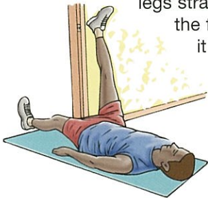
HAMSTRING STRETCH ON WALL

1. HAMSTRING STRETCH ON WALL: Lie on your back with your buttocks close to a doorway, and extend your legs straight out in front of you along the floor. Raise one leg and rest it against the wall next to the door frame. Your other leg should extend through the doorway. You should feel a stretch in the back of your thigh. Hold this position for 15 to 30 seconds. Repeat 3 times.